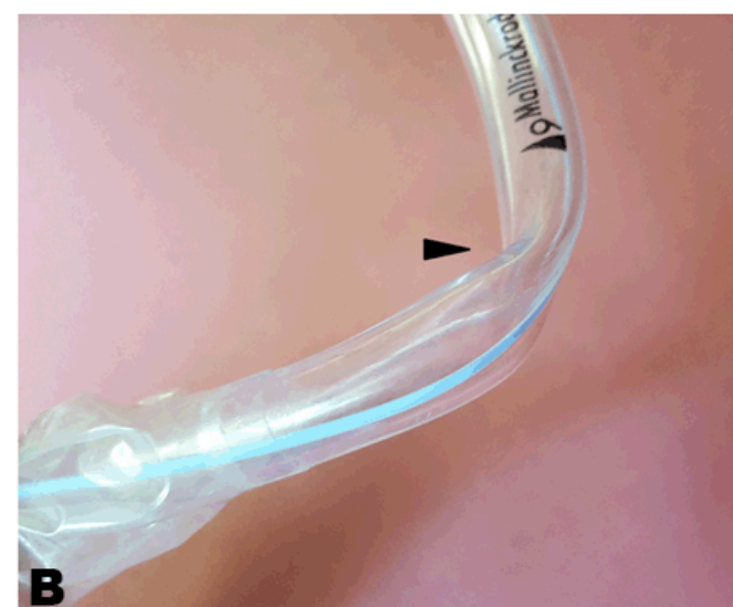
Figure 2: Endotracheal tube (ETT) removed from the patient: (A) Kinked ETT (arrow), and (B) Kinked in an unusual direction (arrow head).