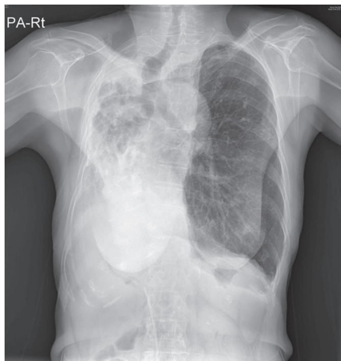
Figure 1: Chest posteroanterior X-ray showing a destruction of the right lung with severe tracheal deviation.

Sezkely et al. reported that, in an analysis of endotracheal tube (ETT) problems, endobronchial