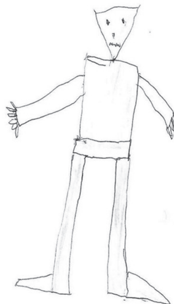
Figure 1: Child's illustration representing goblins seen in hallucinations.

Hallucinations in children are subject of great concern and anxiety to parents and clinicians. In adults, they are often synonymous of psychotic illness, but in children