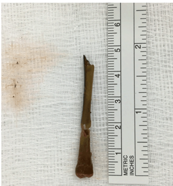
Figure 3: Sharp pointed chicken bone.

peritonitis (39%). The other symptoms that may occur are nausea, vomiting, hematochezia and melena. Preoperative diagnosis remains a challenge and therefore it must be considered in susceptible cases with presence of some predisposing factors [4].