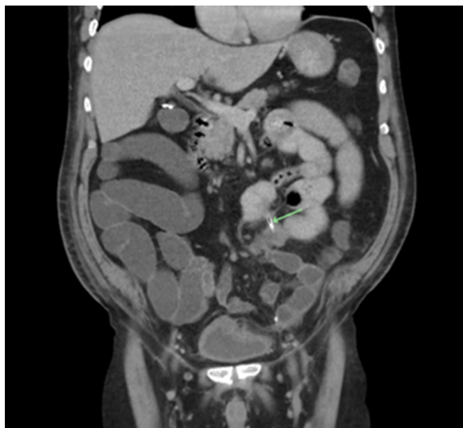
Figure 1: The arrow showing the foreign body.

Swallowing of foreign bodies is most common in children aged between six months and six years [1, 2].