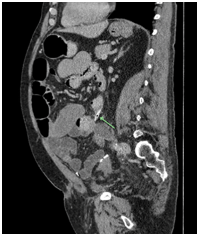
Figure 2: The arrow showing the foreign body.