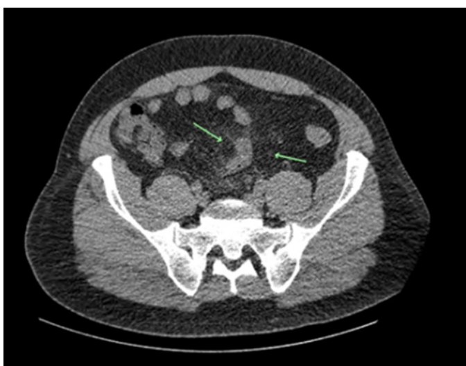
Figure 4: An inflammatory change surrounding a loop of ileum.