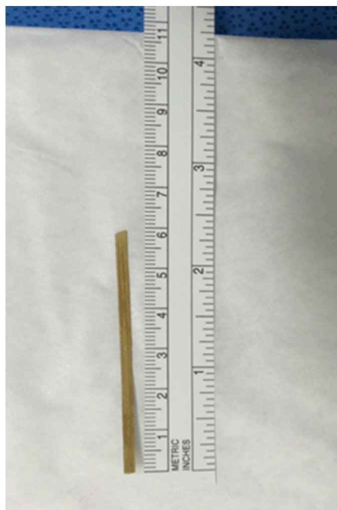
Figure 6: Sharp bamboo stick.