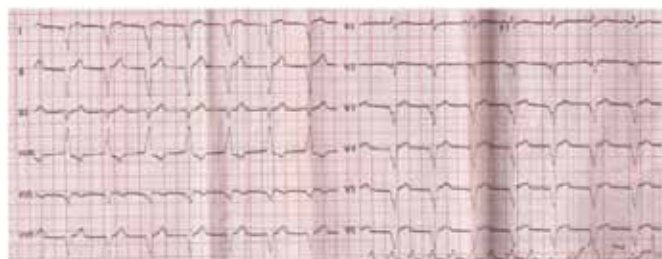
Figure 3: Twelve lead ECG of patient showing WPW type of pre-excitation after electrical cardioversion.