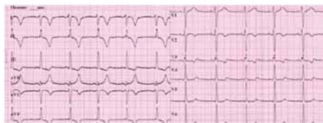
Figure 4: Twelve lead ECG of patient after radiofrequency ablation.