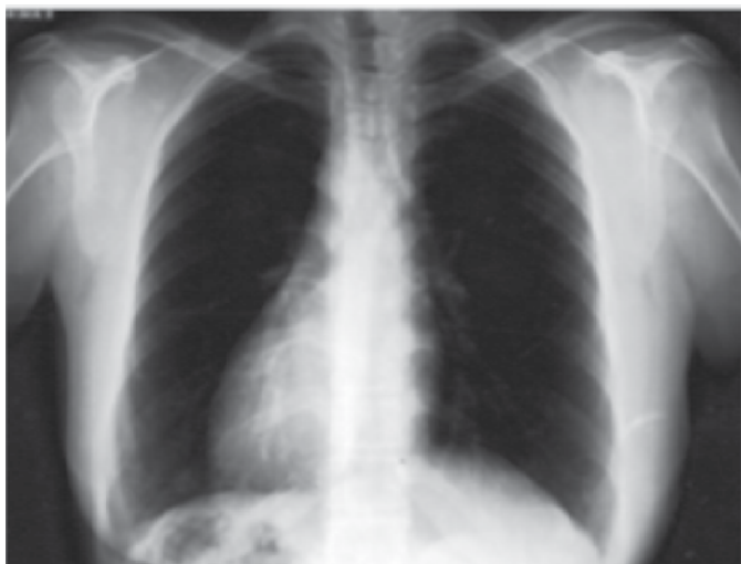
Figure 1: Chest X-ray showing dextrocardia.

This case is about a 33-year-old, non-hypertensive and non-diabetic female, who was presented to emergency complaining of palpitations without chest pain, dyspnea, or syncope. She had a history of situs inversus with dextrocardia, without associated malformations (Figure 1). On physical examination, pulse rate was 150/min, irregular. Her blood pressure was 80/ 60 mmHg. No other abnormality was detected on physical examination. The electrocardiogram revealed Irregularly irregular, wide-QRS complex tachycardia with broad complexes at a rate of 300/minute (Figure 2). The diagnosis of atrial fibrillation was made. The patient was managed with electrical cardioversion of 200 Joules because of hemodynamic instability. Sinus rhythm was achieved, and the review of the electrocardiogram revealed a short P-R interval and the presence of the delta wave, suggestive of WPW type of pre-excitation syndrome (Figure 3). Transthoracic echocardiography revealed normal echocardiographic findings with normal left ventricular systolic function. She was referred for electrophysiological studies. The accessory pathway was identified and found to be capable of fast antegrade conduction. She was successfully treated with radiofrequency ablation (Figure 4).